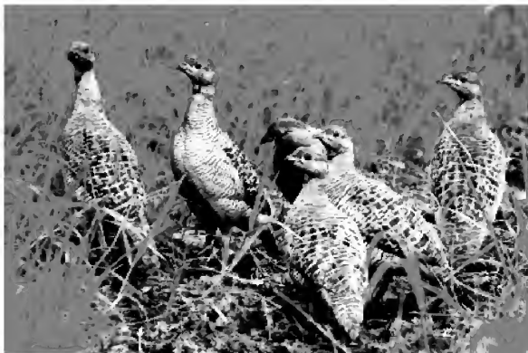
Grey Francolin Francolinus francolinus

A nocturnal bird, it spends the day camouflaged in the dry leaf litter on the forest floor or on branches in such a way that it seems to be a part of the branch; its calls are heard after dusk and at early dawn; it nests here in August.